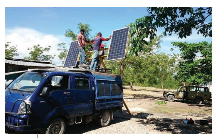
Haiti In-Country Team replace solar panels destroyed during Hurricane Matthew.

Solar Panels give power to many of the LWW clean water systems in Haiti.